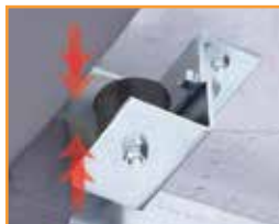
shock mounts greatly reduce noise and vibration