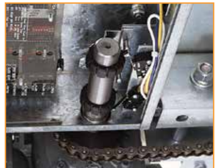
direct drive limit switches easily adjustable and don't need to be reset after power outage