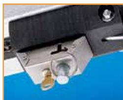
keyed manual release for heavy-duty trolley in case of power