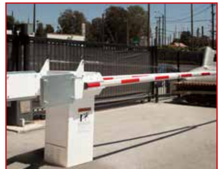
wishbone style aluminum arms up to 27 feet in length