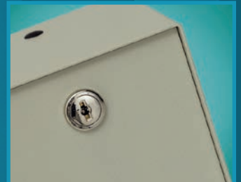
Weigand Controller add your own 26-bit wiegand device for use in a stand-alone application