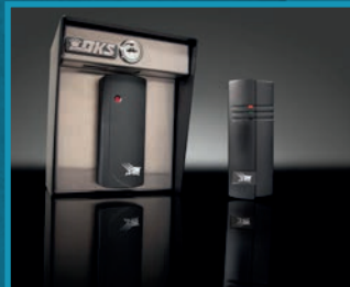
1524 Basic available with or without housing