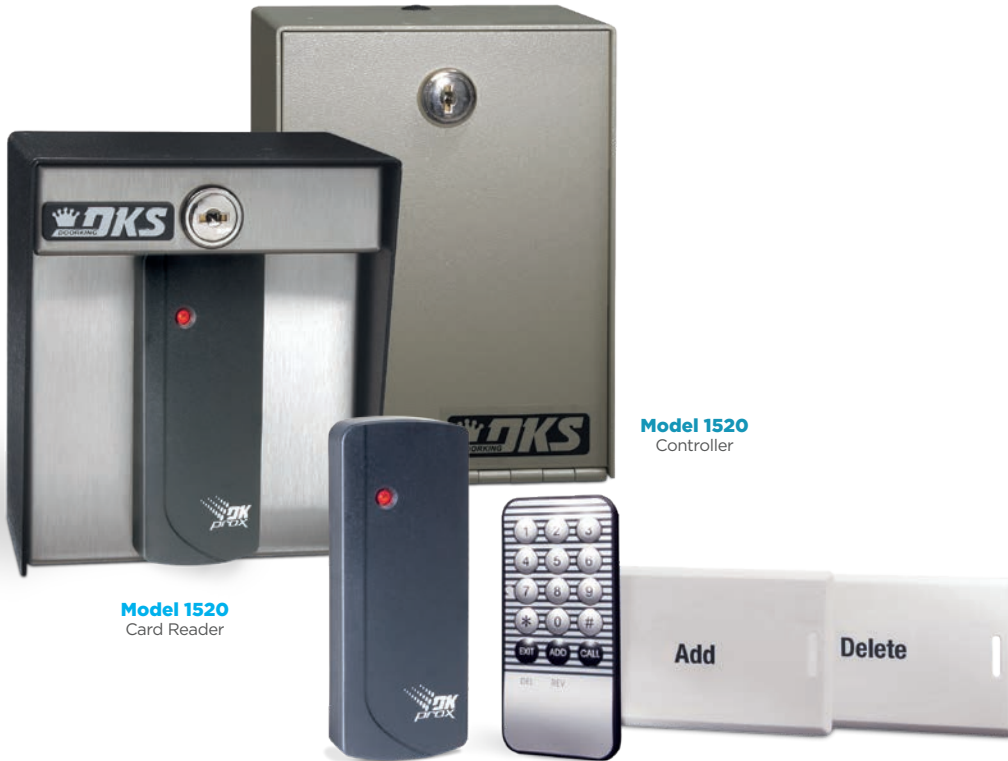
Model 1520 Card Reader