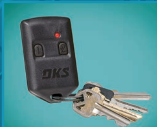
ProxMitters Combines a RF Transmitter with a proximity card tag