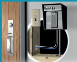
Simple Wiring easily connects to most electric strikes and magnetic locking devices