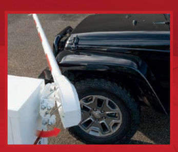
Breakaway Arm Option reduce maintenance costs