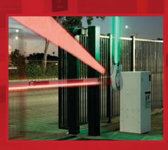
Octagonal Lighted Signal Arm Option light the way for customers to exit easily and safely with signals and sensors