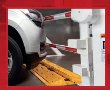
Lane Barrier Option surface mount accessory