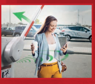
Pedestrian Protection System Available it's aware - even when they're not