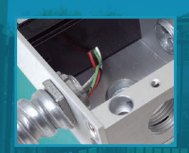
Electrical enclosures for easy installation (1200 lbs. only)

GATED COMMUNITIES • APARTMENT COMPLEXES • RESIDENTIAL • CONDOS/RESIDENT HALL • MIXED USE • COMMERCIAL/INDUSTRIAL • MAXIMUM SECURITY