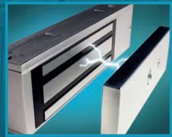
No Moving Parts to wear out or break which assures an extremely long life