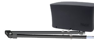
Vanguard 3501 Swing