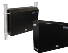
Slide Gate Operator

SYSTEM DESIGN SUPPORT: Contact Nice/HySecurity for help with custom site requirements, CAD drawings, tech manuals or other specifications support.