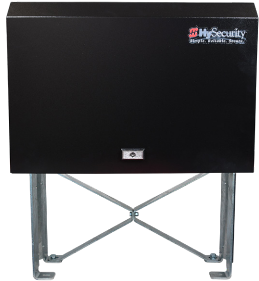
Optional base extension and retrofit adapter