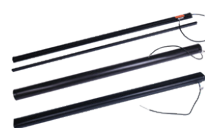
ASO Edge Sensors